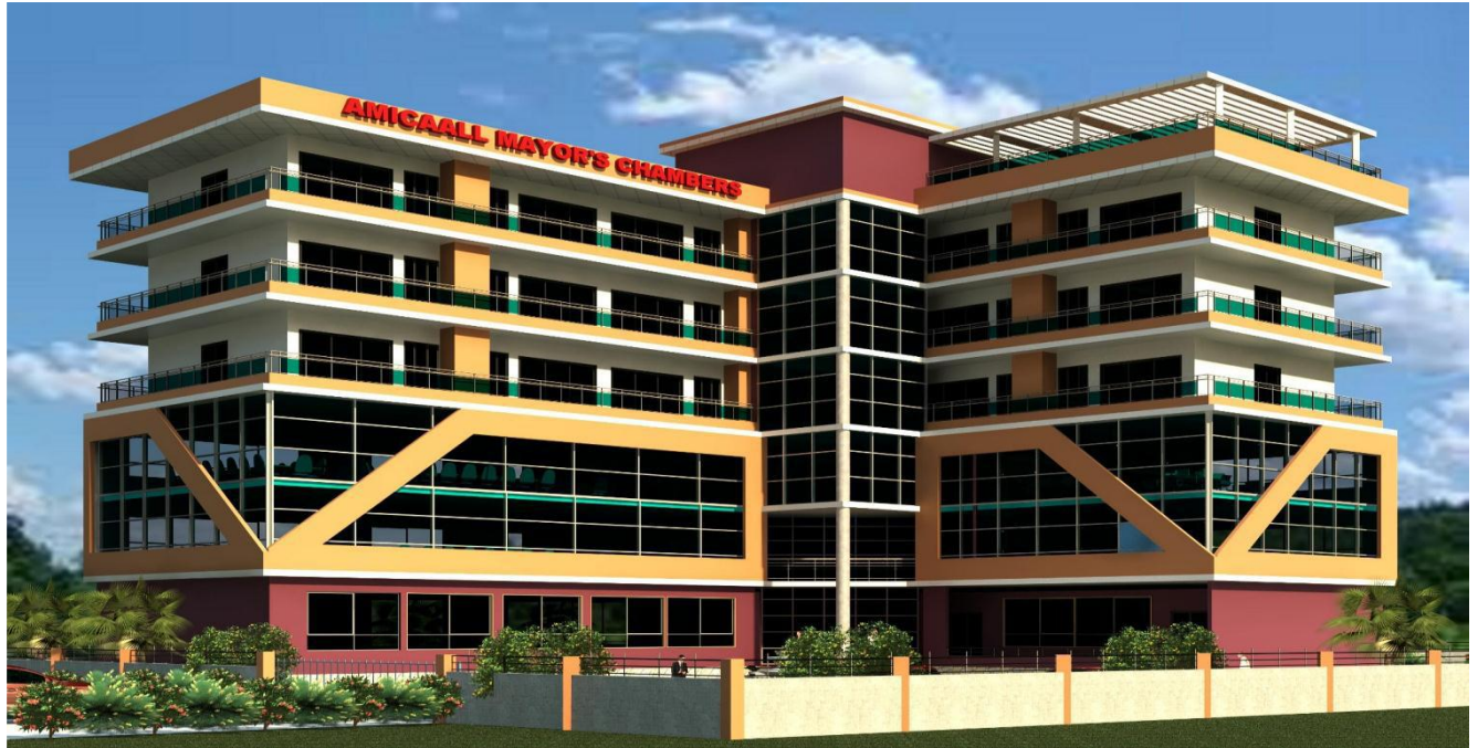
Artistic impression of proposed AMICAALL Uganda house