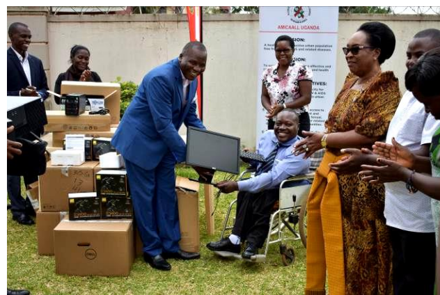
AMICAALL board member hands over a computer to the Mayor Namayumba Town Council as other recipients look on

AMICAALL has set up and joined online platforms, like Website, Facebook, Twitter, WhatsApp groups, and email groups. These platforms are used to share information on NCDs, WASH, governance and HIV/AIDS as well as , opportunities like fundraising, events, and programmes with members and other