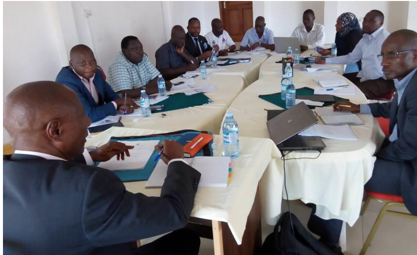
AMICAALL staff making a presentation to Members of the Alliance Executive Council (Board)

During this period four Alliance Executive Council (AEC) and four AMICAALL National Technical Advisory Committee (ANTAC) meetings took place. As a result, these organs have been able to review and approve organizational policy documents, do staff recruitment and contribute to resource mobilization.