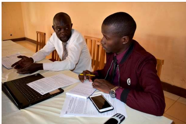
A MoLG officer conducting a needs assessment of the planning unit in Nauyo -Bugema Town