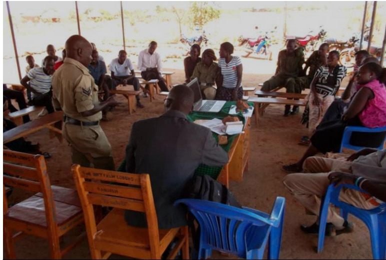
A Security Personnel making a presentation during a dialogue with key populations in Lorengechora Town Council, Napak district

AMICAALL conducted dialogue meetings in the Karamoja region with key populations focusing on the topics like HIV prevention, SRHR - relationship between STIs and HIV among others. During these meetings, among the key cross cutting issues highlighted were majorly limited knowledge on STIs, child neglect, poor health seeking behaviors by the youth and other members of the community as well as limited access to HIV and SRH services. As a result 21 community outreach camps were conducted which provided HIV and SRH services like HTS, STI screening to the Key populations.