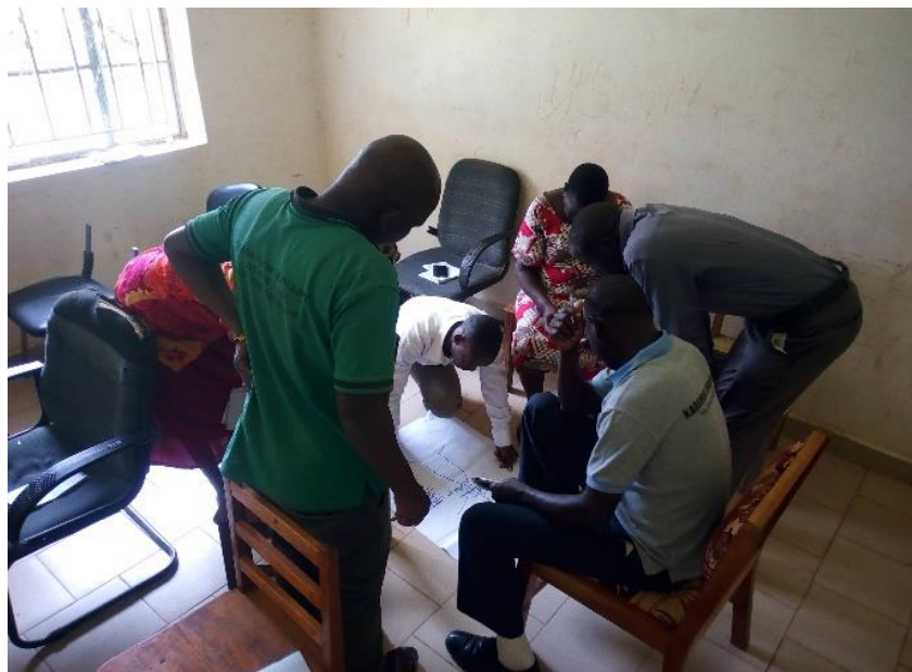
Kaabong Town Council AIDS Committee drawing an HIV/AIDS risk map during a quarterly meeting

With funding support from DGF, AMICAALL provided technical and logistical support ( computers) to planning units of five urban authorities (Iganga and Nansana Municipalities; Nauyo Bugema and Namayumba Town Councils; Lubaga Division Urban Council). The computers have enabled the planning units to improve on records keeping and reporting. Set up and manage various online media platforms for generating and sharing strategic information on HIV, WASH and NCDs response.