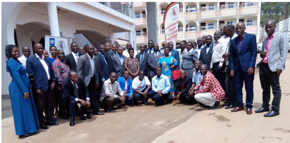
Participants of the Central regional meeting

While the Northern regional meeting we attended by 98 participants (84M 14F) representing Municipalities, Municipal divisions and Town Councils.