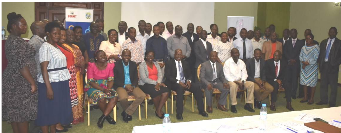
Participants of the the meeting on HIV/AIDS,TB and human rights held at Imperial Royale Hotel on 19 th September 2019

AMICAALL in partnership with UGANET under the Global Fund, conducted one day Municipality leaders meeting with the objectives to introduce the activity to urban authority leadership and other stakeholders; to conduct a needs assessment with the urban leadership and participating stakeholders; to orient State Attorneys on HIV/TB & human rights related issues. A total of 74 (54M 20F) participants attended the meeting with each Municipality represented by a Mayor, Member of Parliament, Town Clerk, Speaker, Community Development Officer (CDO), State Attorney, AMICAALL Local Coordinator and 2 Civil Society representatives from CSOs working in the areas of HIV/TB or Human Rights in the municipality as well as representatives from the relevant ministries, departments and agencies (MDAs), Key Populations (KPs). Some of the cross cutting issues included lack of confidentiality among service providers, Stigmatization and limited access to information. Action plans were developed for implementation by respective urban authorities.