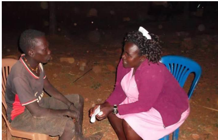
A young person being counselled before receiving his HIV results at a Moonlight testing in Lorengechora Town Council