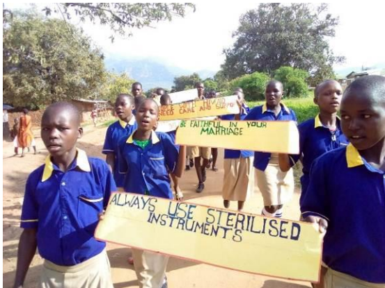
Pupils of Nakapiripirit P/S marching through the streets to mobilize the community for HTS during a street event

Seven (7) street events were conducted in 7 urban authorities. The events included artists performing songs to sensitize people on modes of HIV transmission and how it can be prevented. Some urban authorities had a band with school pupils and students marching in the streets and carrying placards with HIV prevention messages.