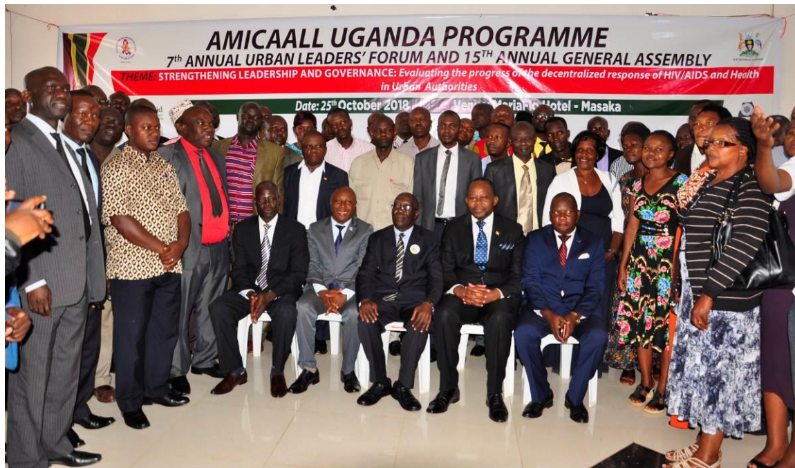
Participants pose for the photo after the 2017/18 Urban Leaders Forum and Annual General Assembly in Masaka Municipality

The 7 th ULF was conducted in Maria Flo Hotel, Masaka Municipality on 25 th October 2018. It was attended by City, Municipality and Town Council Mayors and Town Clerks as well as Civil Society Organizations who totaled to 200 participants. The forum was held under theme "Strengthening Leadership and Governance; evaluating the progress of the decentralized response of HIV/AIDS and Health in urban authorities."