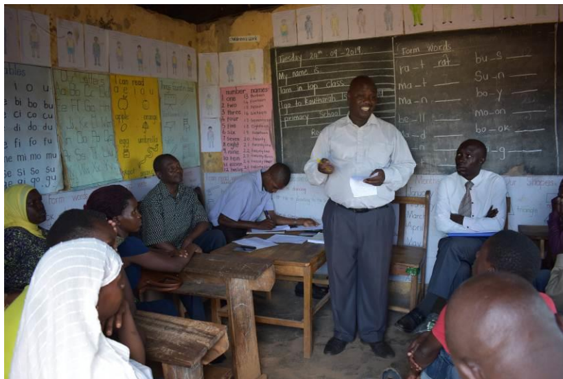
A leader addressing the community in Nauyo – Bugema about the responsibilities of elected leaders and technical staff

AMICAALLL with support from DGF facilitated elected and technical leaders of Nauyo Bugema Town Council to conduct 3 community meetings. The community meeting were intended to address the misconceptions and wrong expectations citizens have of leaders and their roles and responsibilities and to equip citizens with knowledge about their roles in the governance of their areas. The meetings took place in three wards (Napoli Lower, Bukasakya, Bugema Qoran) and involved 94 (59M & 35F) participants.