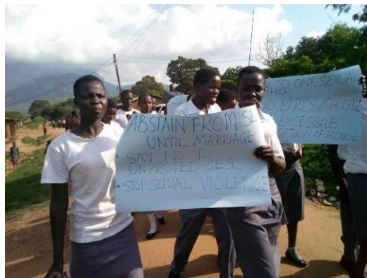
Nakapiripirit Seed Sec School marching during a street event to mobilize the community for HTS